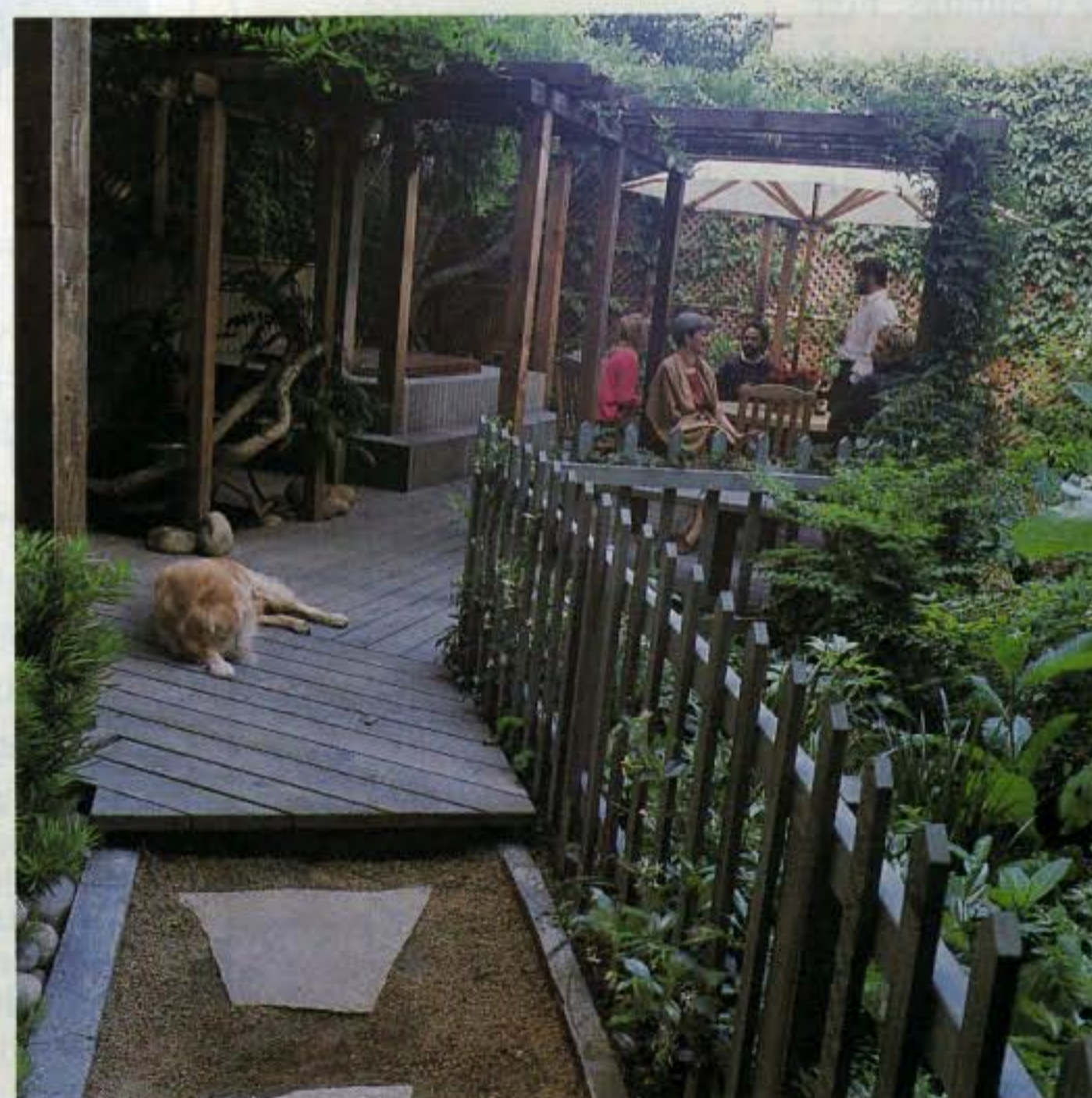
Gentle curve of fencing (above) keeps dog and plants apart. Mature wisteria sprawls across trellis over spa. It rises from ground near ceramic urn-fountain (left) that overflows, then recirculates water from vinyl-lined basin built into deck

The existing plants—a large wisteria, a bougainvillea, and a Japanese plum—were common in California missions. Garden designer Chris Jacobson continued the mission theme by adding lemon trees, honeysuckle, jasmine, and passion vine, which were also selected for their low water needs. □