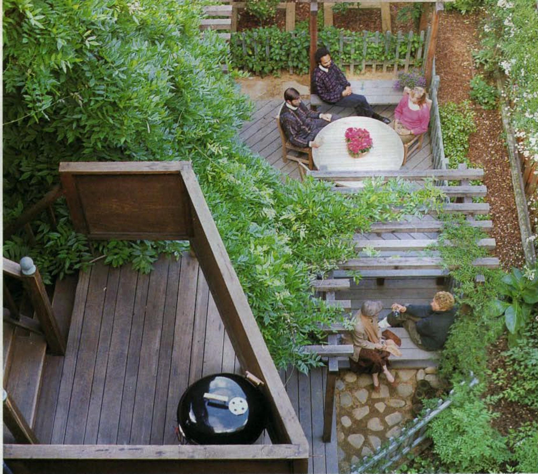
Third-floor view shows decks filling much of garden, with planting pockets along outer edges. Simple trellis structures topped by 4-by-4s support vines, shade seating